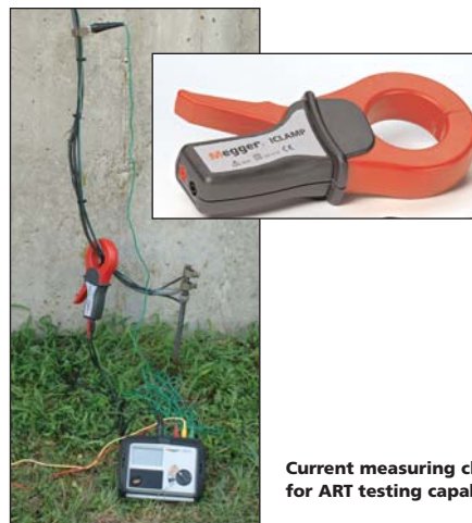
Current measuring clamp (inset) for ART testing capability

The ART method employs leads and probes just as does any traditional tester. Ground resistance can be profiled and graphed by moving the potential probe against the position of the current probe, and a Fall of Potential graph, Slope Method mathematical proof, or any of the other proven methods utilized to demonstrate the accuracy of the test. The only thing different from the operation of a familiar, traditional ground tester is that the clamp permits separation of the test currents in an attached or otherwise parallel-grounded system. This technique enables local grounds to be tested without lifting the utility connection, yet with the ease, reliability and confidence of a separate commissioning test.