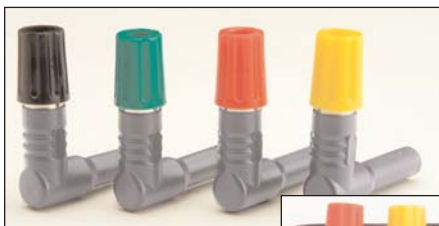
Terminal Adapters are optional accessories used to allow the DET3 and DET4 Series units' terminals to accept alternative cable connections.