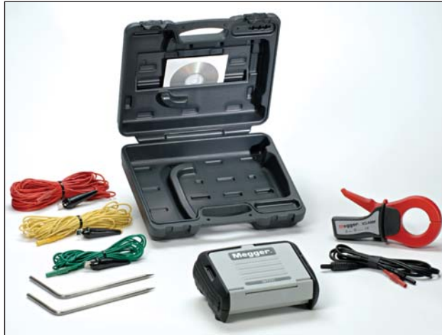
Each instrument comes complete with three sets of leads, two test spikes, instruction manual CD, and a rugged carrying case. (Current measuring clamp, shown, is an optional accessory for performing the ART testing capability using the DET3TC only.)